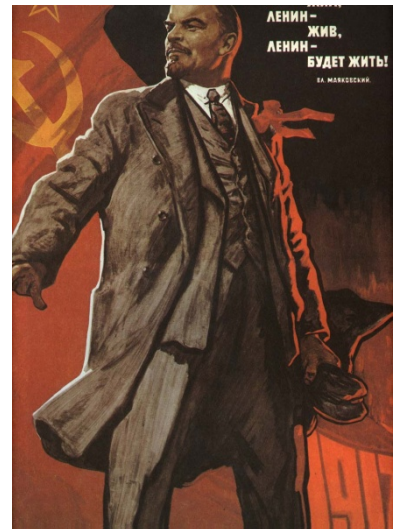
Goncharova Peasants Gathering Grapes (1911) Malevich Painterly Realism (1915) Ivanov Soviet poster Lenin will live!