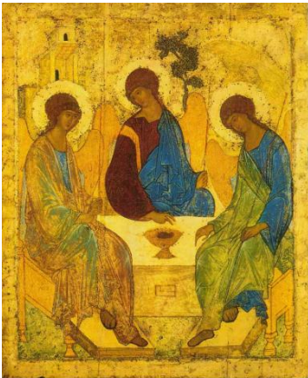
Rublev Holy Trinity (1410)