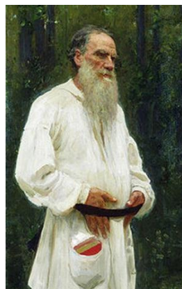
Repin Portrait of Tolstoy (1901)